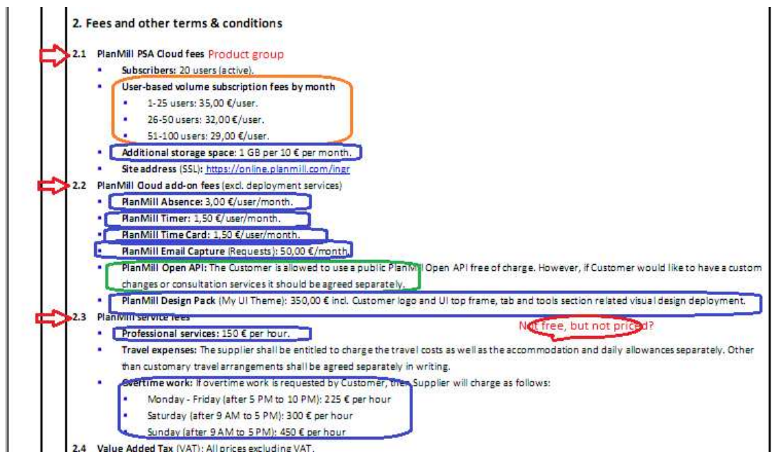
Figure 5. Fees, service levels etc. are saved as "Contracts items": red arrows = product groups, orange = volume priced items, blue= normal priced items, green= items with no price

Contracts items contain much information which in later releases can be used as bases for automatic invoicing. In version 1.0, these are just for storing information and metadata about the Contracts.